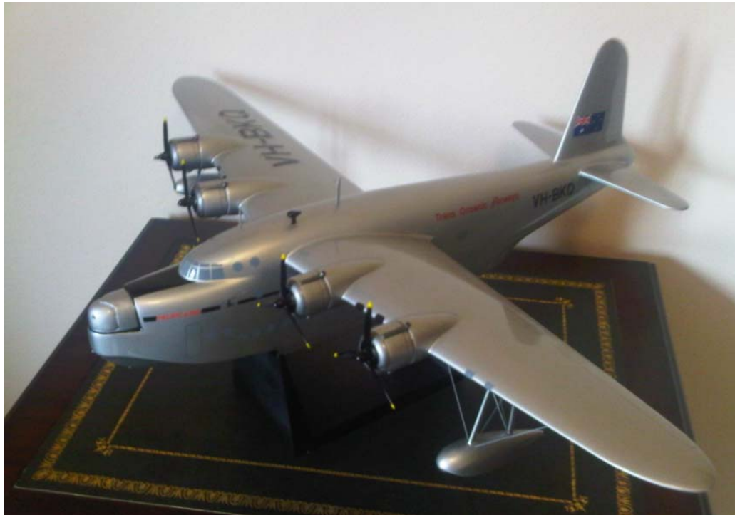
1:50 scale model of Trans Oceanic Short Sunderland VH-BKQ presented to Philip Dulhunty