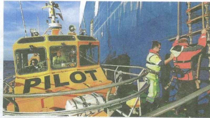
Ship to shore ... marine pilots assist in guiding vessels to their port.

About 99 per cent of ships that come into Sydney are now foreign-flagged and even though the international shipping language is English, many crews do not speak the language. While Amos enjoys meeting people from all walks of life who have similar interests to himself,