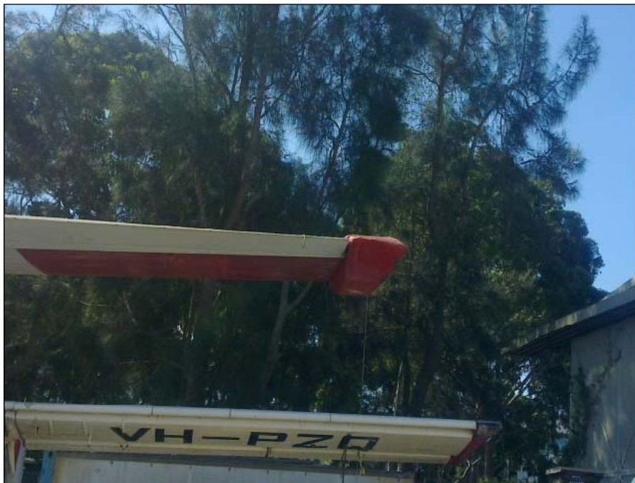
We have retraction – nice and clean!