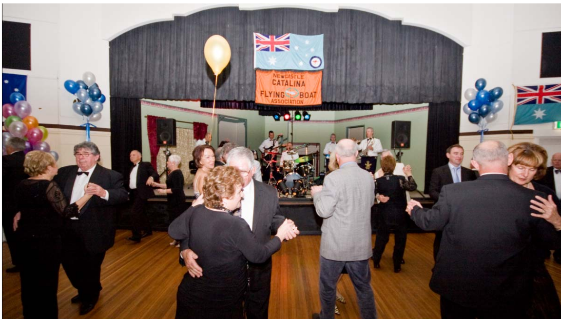
The Catalina Festival Ball – 11 July 2009