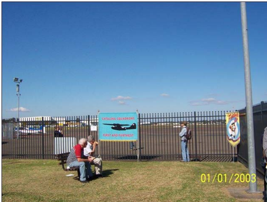
Catalina Squadrons banner